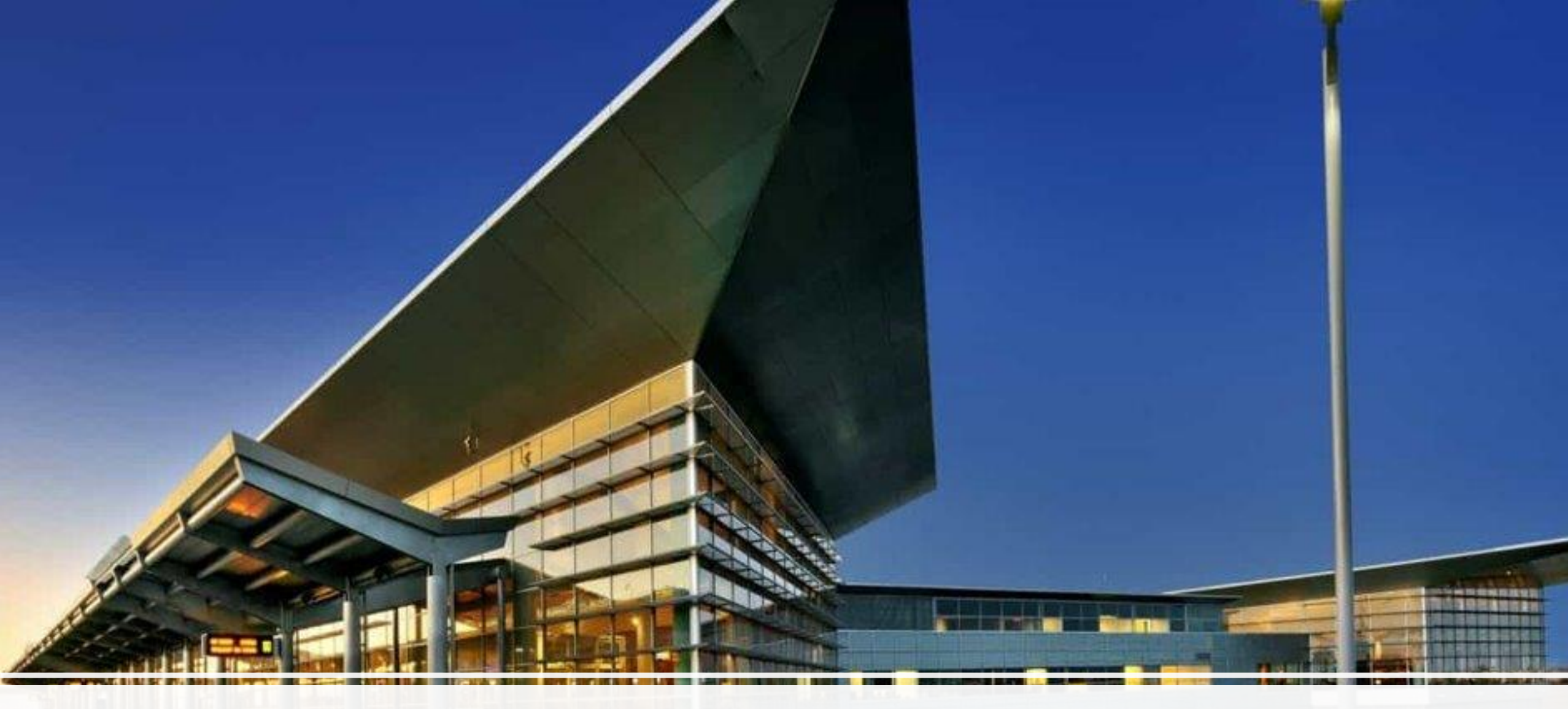
Day 1 – March 22 – Start Tour